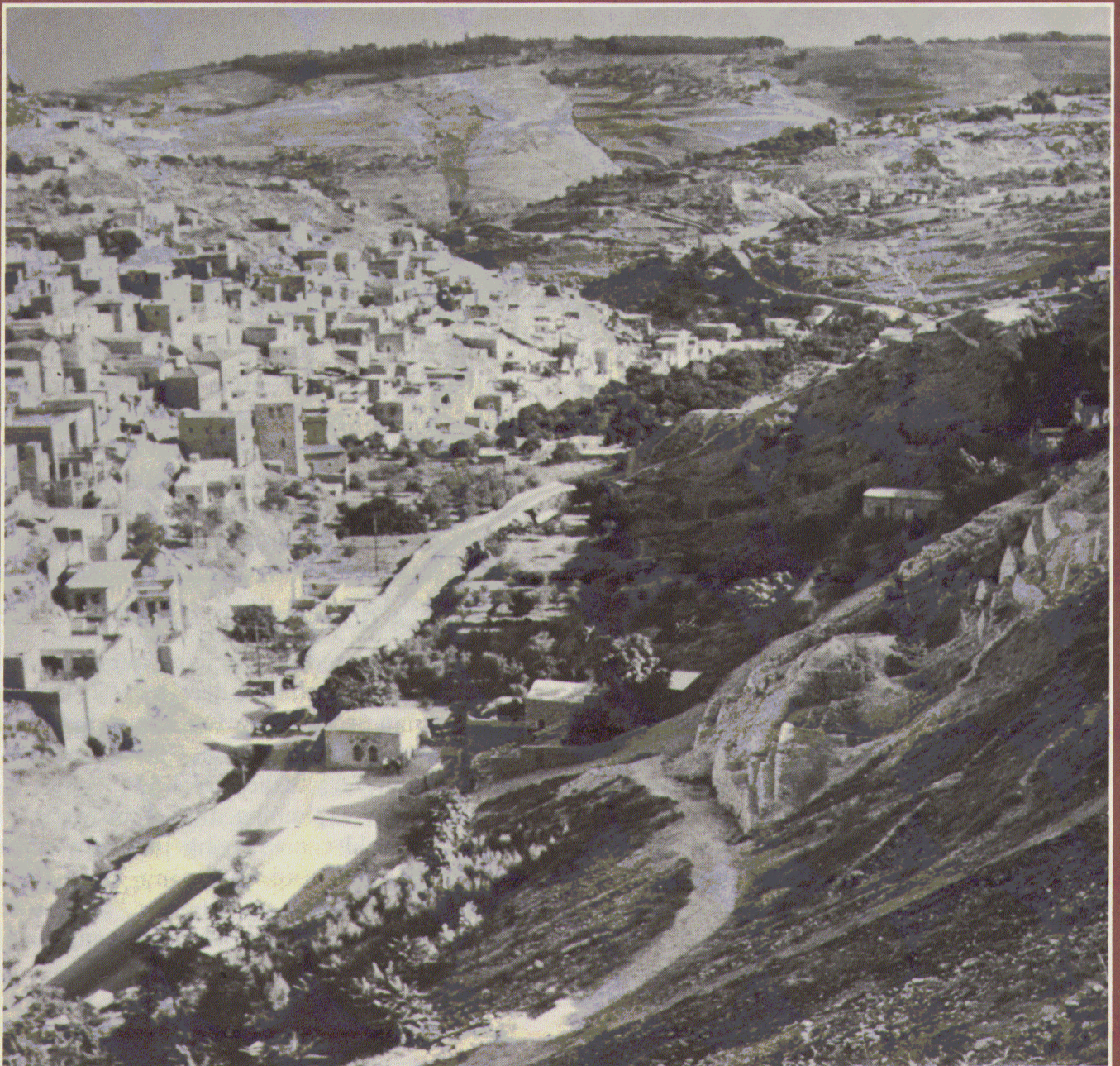
Christ's Olivet Prophecy