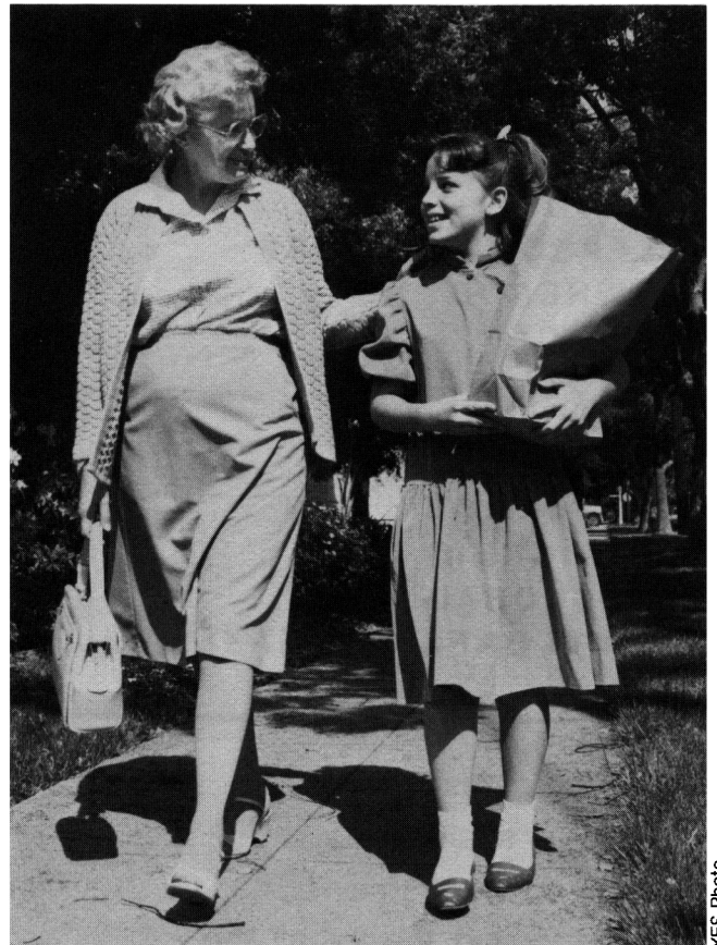
Young people can begin preparing today for exciting jobs in the World Tomorrow.

In our next lesson, we will conclude the final week of Christ’s life with the events of Christ’s final Passover.